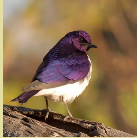
VIOLET BACKED STARLING